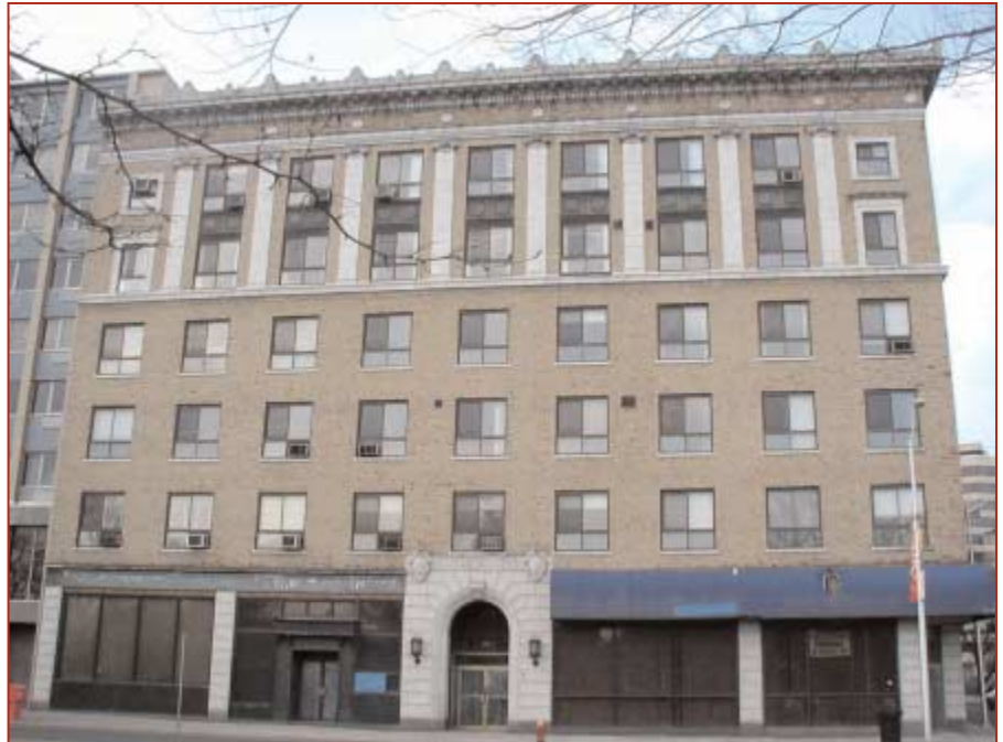
410 Asylum Street, also known as the Capitol Building.

In 1998, the Connecticut Historical Commission successfully petitioned the