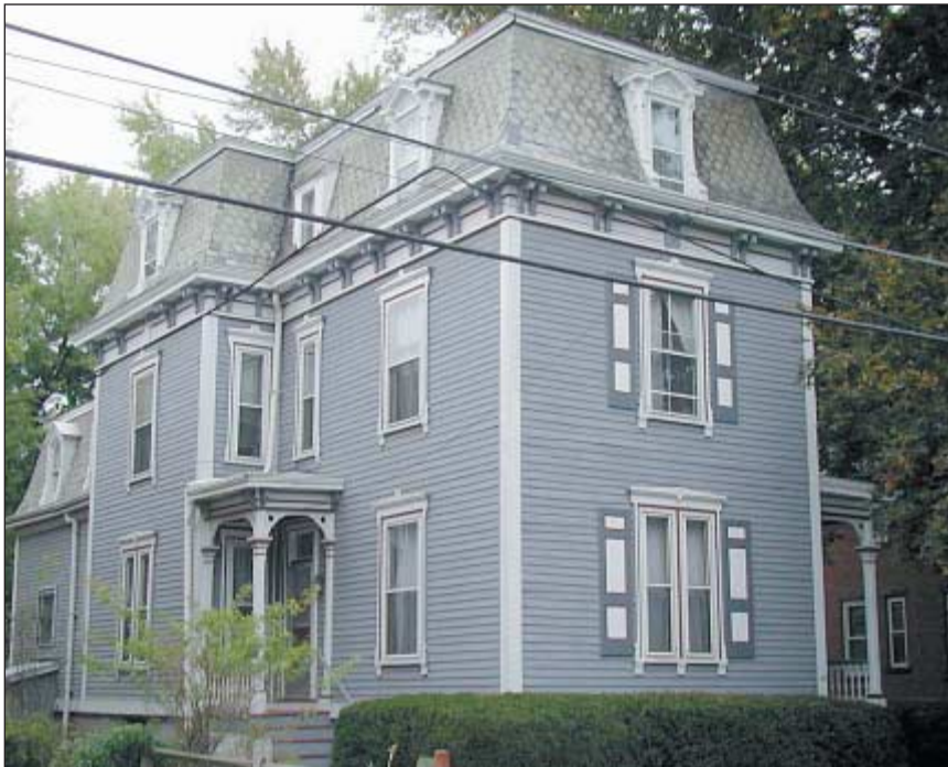
This 1875 Second-Empire home at 40 Allen Place is one of the buildings in the new Allen Place-Lincoln Street Historic District.

In a collaboration between HPA and the Frog Hollow South Neighborhood Revitalization Zone Committee, a new Allen Place-Lincoln Street Historic District has been added to the National Register of Historic Places. The district is immediately south of the existing Frog Hollow Historic District and includes Allen Place, Lincoln Street and Vernon Street between Washington and Affleck Streets. The district, which was built up primarily between 1890 and 1910, is characterized by a mixture of two- and three-story brick and wood frame buildings in a variety of Queen Anne building styles.