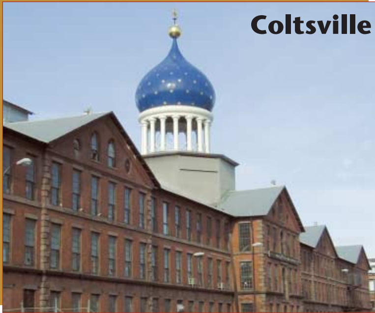
The Colt Building, with its landmark blue onion dome.