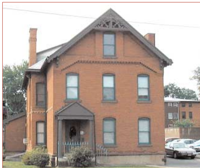
47 Sigourney Street, a property owned by Aetna, is currently under the threat of demolition.

The relocation of a building — especially a brick building — is very expensive and, in this case, can add $150,000 or more to the cost of remodeling the building for