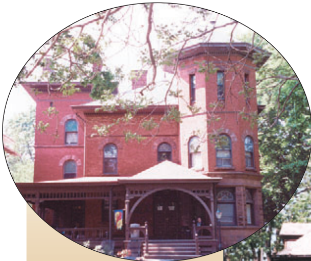
The Linus Plimpton House c.1865 (above) and the 1888 Alanson Trask House (right) were featured stops along the walking tour of the Asylum Hill neighborhood.

The walk was not that long — only a dozen or so blocks from Asylum and Sigourney to Farmington up to Woodland, with a detour down Laurel, Niles and Forest Streets and back to Asylum — but it revealed the way in which the Asylum Hill neighborhood packs a lot of history into a small space. 🌿